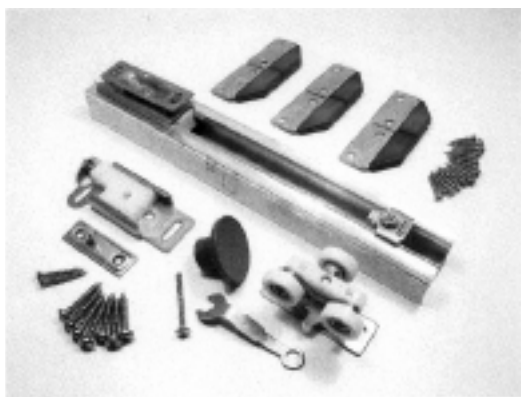
2 Panel Complete Packaged Set

Example: 48" x 84" Opening = (4 – Panels @ 11 3/4" x 81")